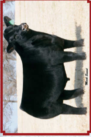
Limestone Dark Horse