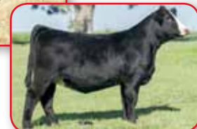
LHT Miss Bonnie 70B, Full Sibling