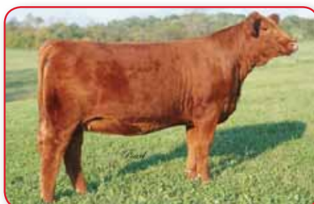
Lazy H Miss Remington, Dam