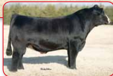
SVF Steel Force S701, Sire