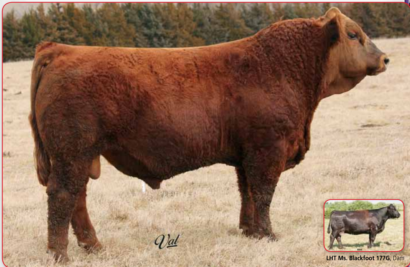
LHT Ms. Blackfoot 177G, Dam

This is a powerful set of strong age fall and coming two year old bulls. If you are looking to cover a lot of cows with big, stout bulls, take a close look here!