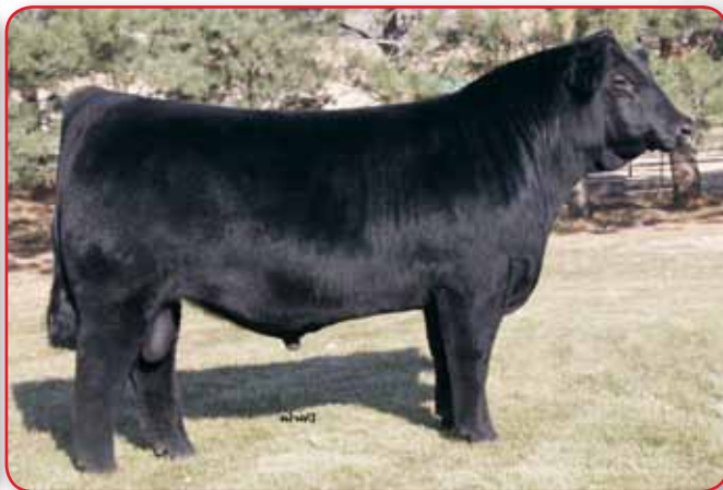
SS/PRS High Voltage 244X, Sire