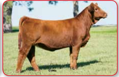
LHT Lady In Red 146B, Full Sibling