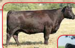
KJ Pride 5129, Dam