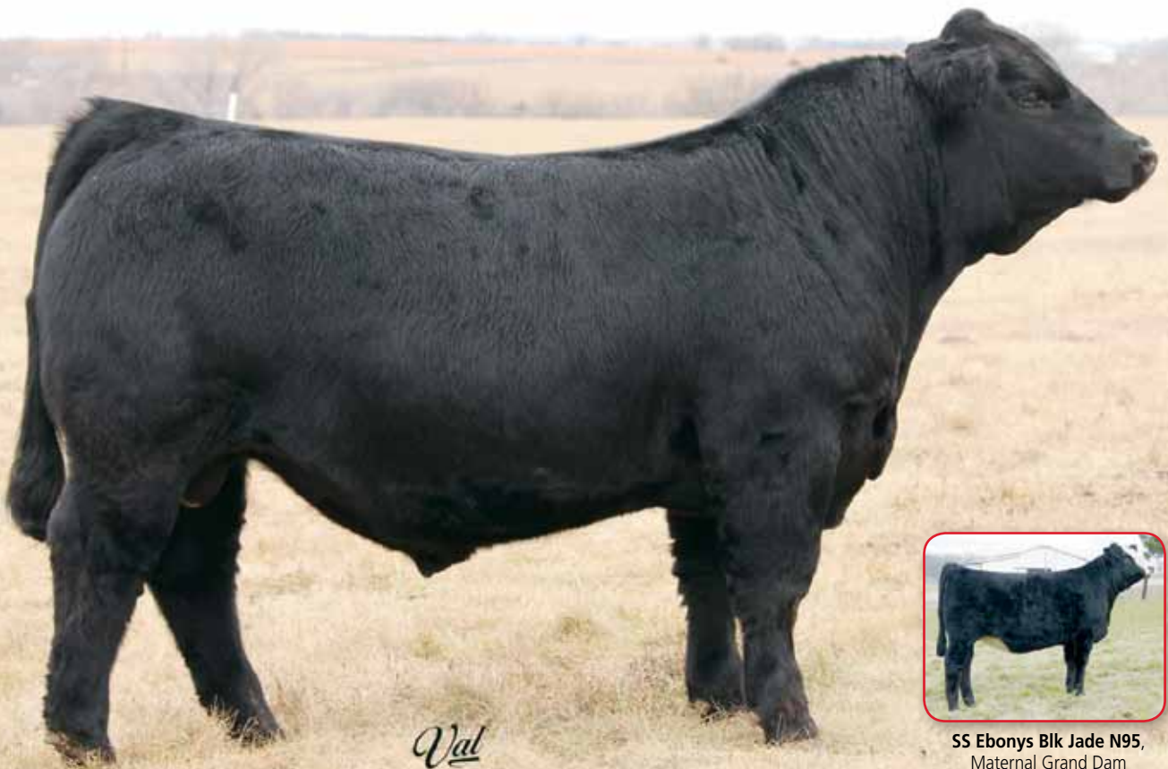
SS Ebonys Blk Jade N95, Maternal Grand Dam