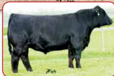
MCM Top Grade 018X, Sire