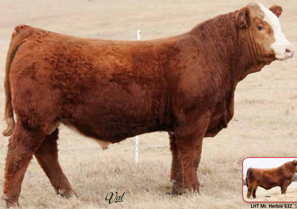
LHT Mr. Herbie 63Z, Sire