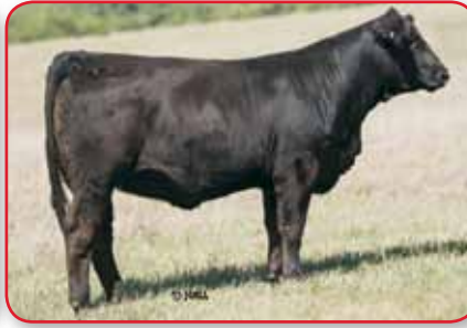
LHT Ms. Fatt Butt 192A, Maternal Sibling