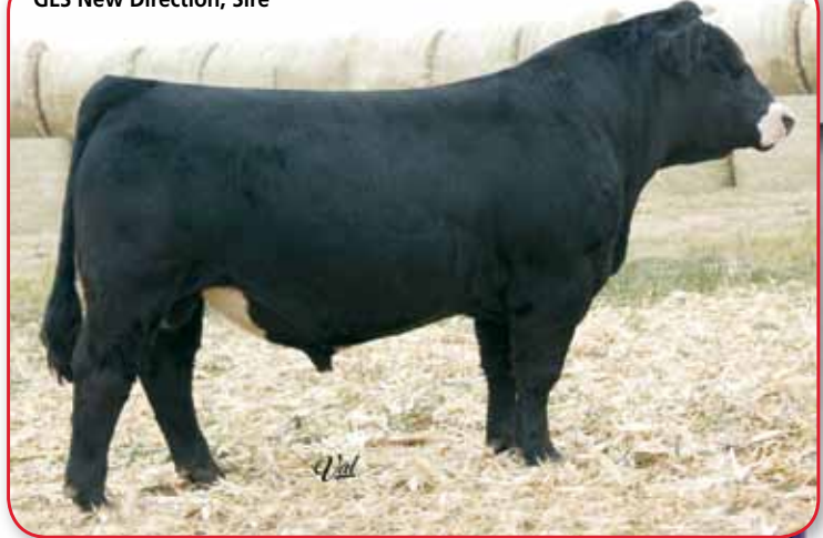
GLS New Direction, Sire