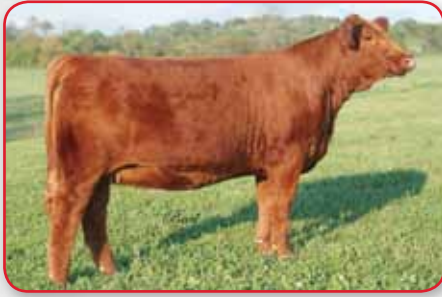
Lazy H Miss Remington, Dam