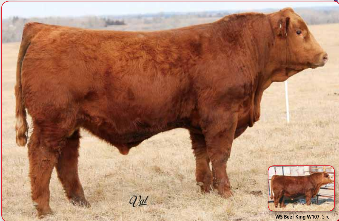
WS Beef King W107, Sire