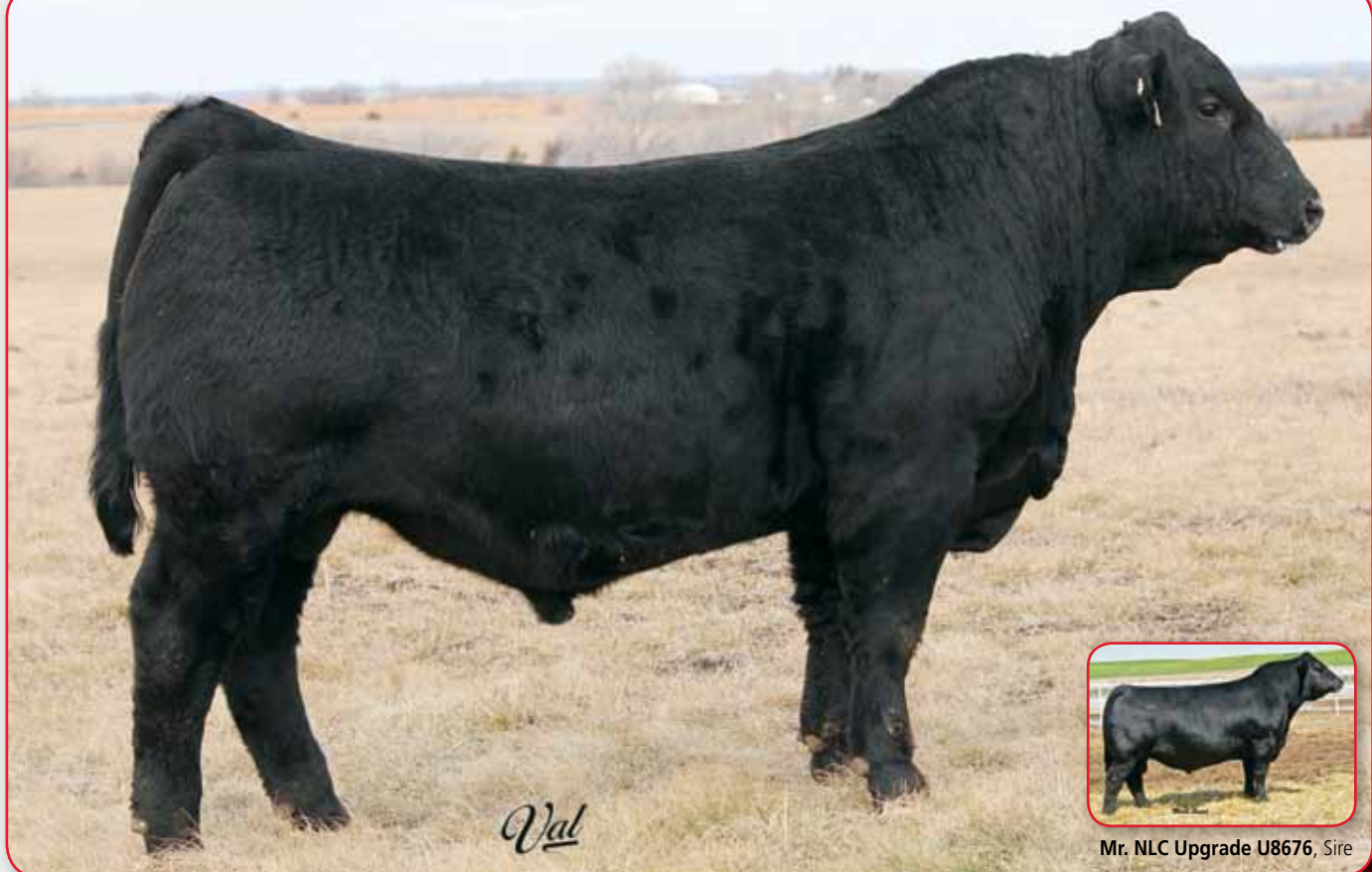
Mr. NLC Upgrade U8676, Sire