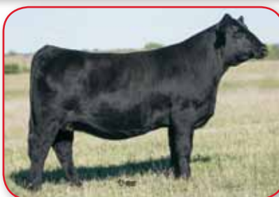
Lazy H/Adkins Blkstar Z15, Dam