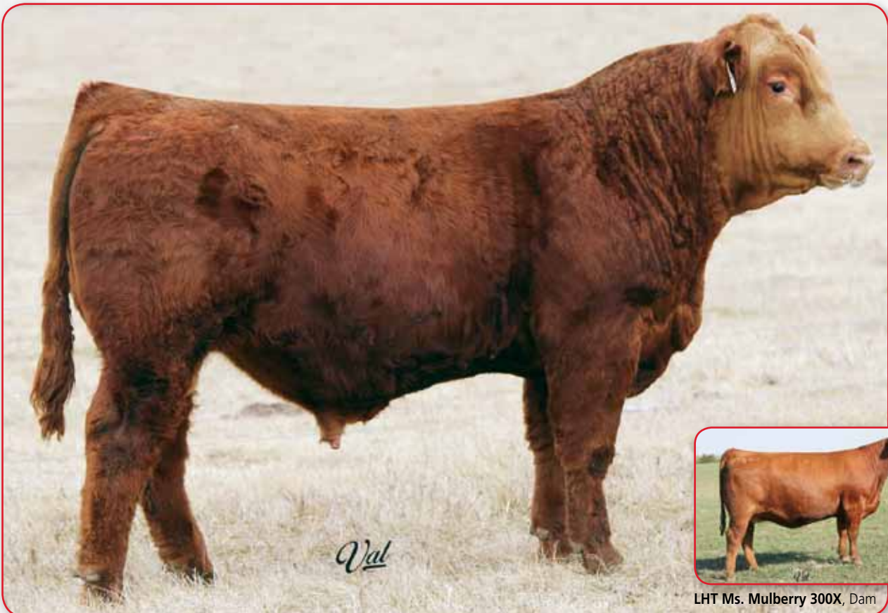
LHT Ms. Mulberry 300X, Dam