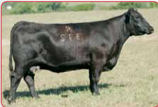
T K Edella R372, Dam