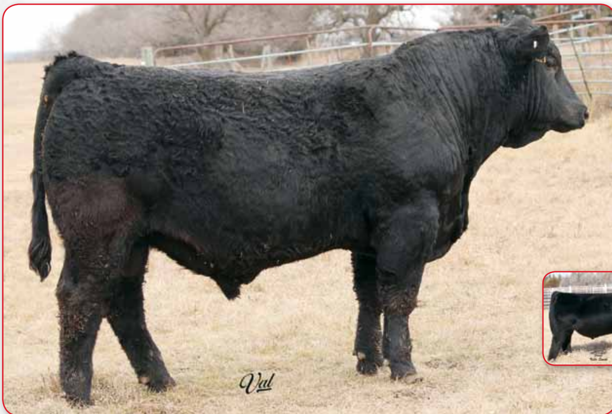
W/C Wide Track 694Y, Sire