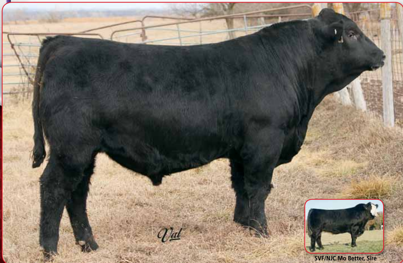
SVF/NJC Mo Better, Sire