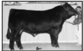
Sire: WLE CSA Galvanizer

Black Irish Kansas WLE CSA Galvanizer Nichols Miss 77U Handy Man (Power Drive) AF Miss Handy 47P NJC Focvus (Black Irish Kansas)