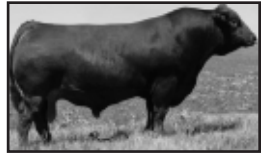
Service Sire: Remington Red Label

HC Power Drive 88H H3C Pure Power M209 BH Lady in Red 966J Kenco/MF Powerline 204L IVS Miss Polly 871R MCC Miss 600U 871G