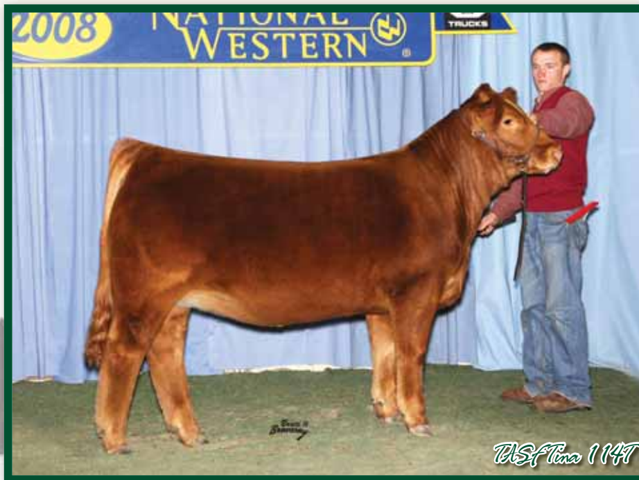
TASF Tina 114T

One of the most elegant yet powerful and broody females ever born at Thomas' is this great female! Loaded with top, muscle shape and very solid numbers you could flush this female purebred, LimFlex, or club calf and stand back.. the fuse is lit! Selling a flush to the bull of the buyers choice. Guaranteeing five grade #1 embryos to the bull of buyers choice.