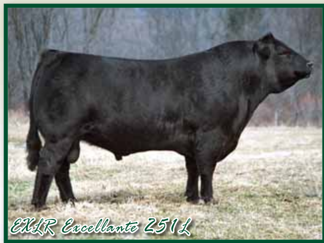
EXLR Excellante 251L

Awesome Limflex bull with an incredible pedigree. Pacesetter is loaded with marbling, maternal heritage and predictability!