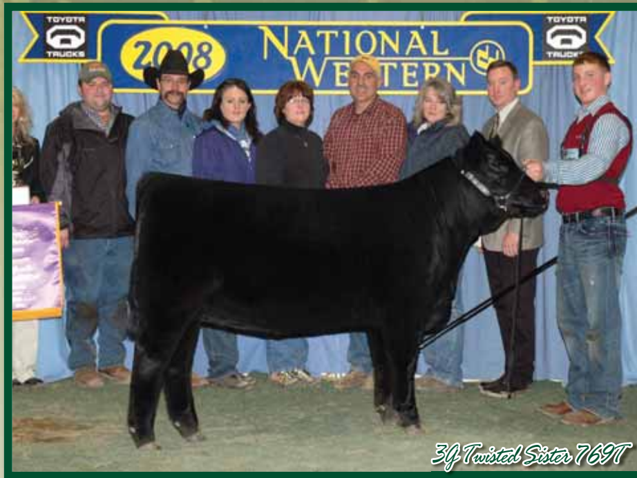
3G Twisted Sister 769T