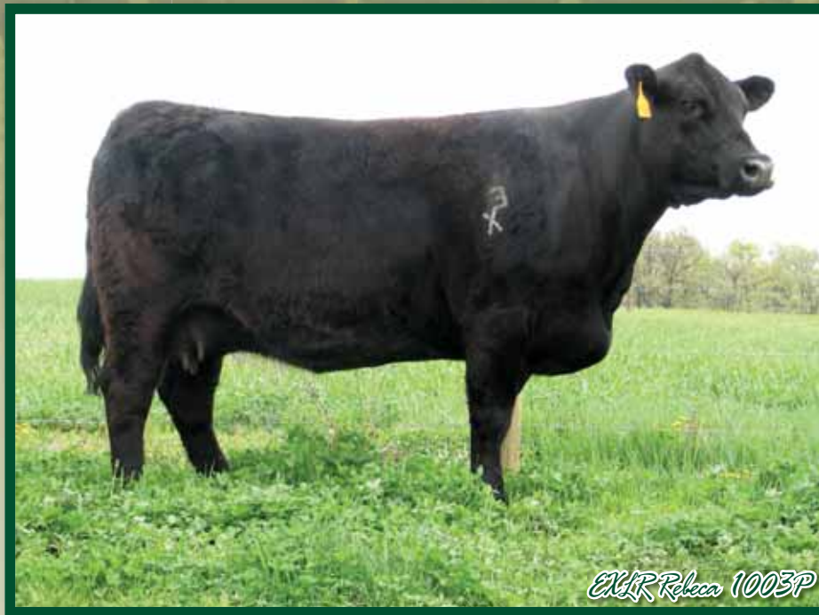
EXLR Rebecca 1003P