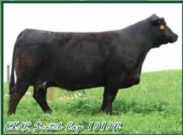
EXLR Scotch Cap 1010N

CONSIGNED BY ELDERS BRANCH FARM, THREE SPRINGS, PA Embryos out of Excellante going back the predictable 1407 and RR Scotch Cap 9440 on the angus side. 9440 was bred by the great breeding program, Rollin Rock Angus in Sidney, Montana. Grade 1 embryos: Dam is a flushmate to EXLR Scotch Cap 1005N.