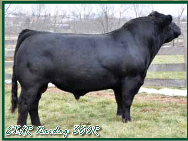
EXLR Nasdaq 380R