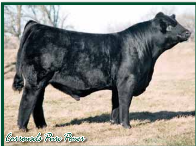
Carrousel's Pure Power

Grade 1 embryos: Dam is a flushmate to Rebeca 1019P.