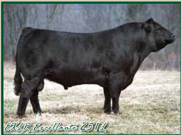
EXLR Excellante 251L

Due 4-5-10. Recipient is registered angus cow (AAA-13764657).